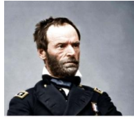
WILLIAM TECUMSEH SHERMAN